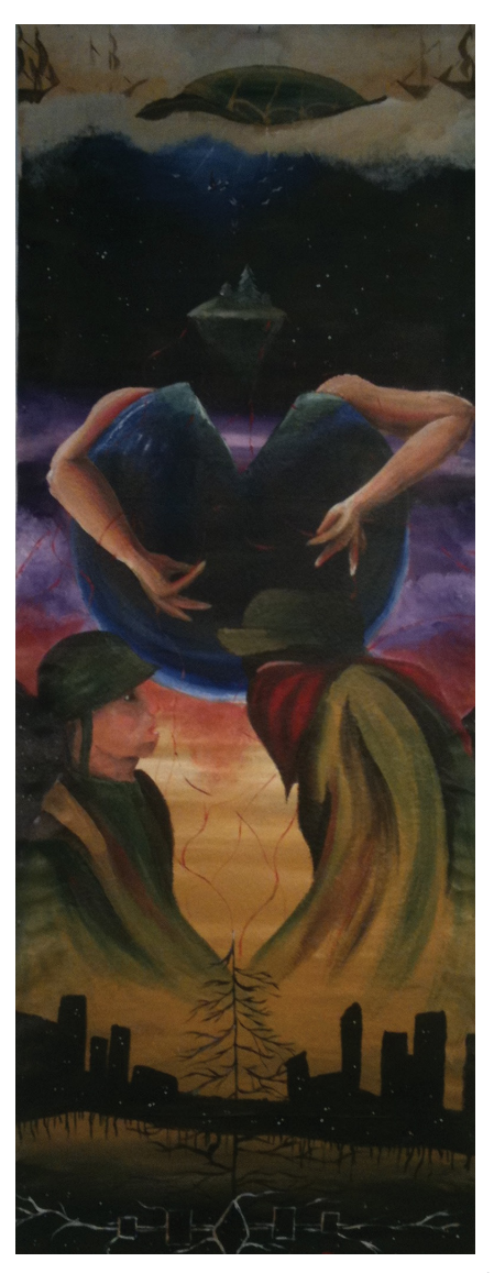
v + vi